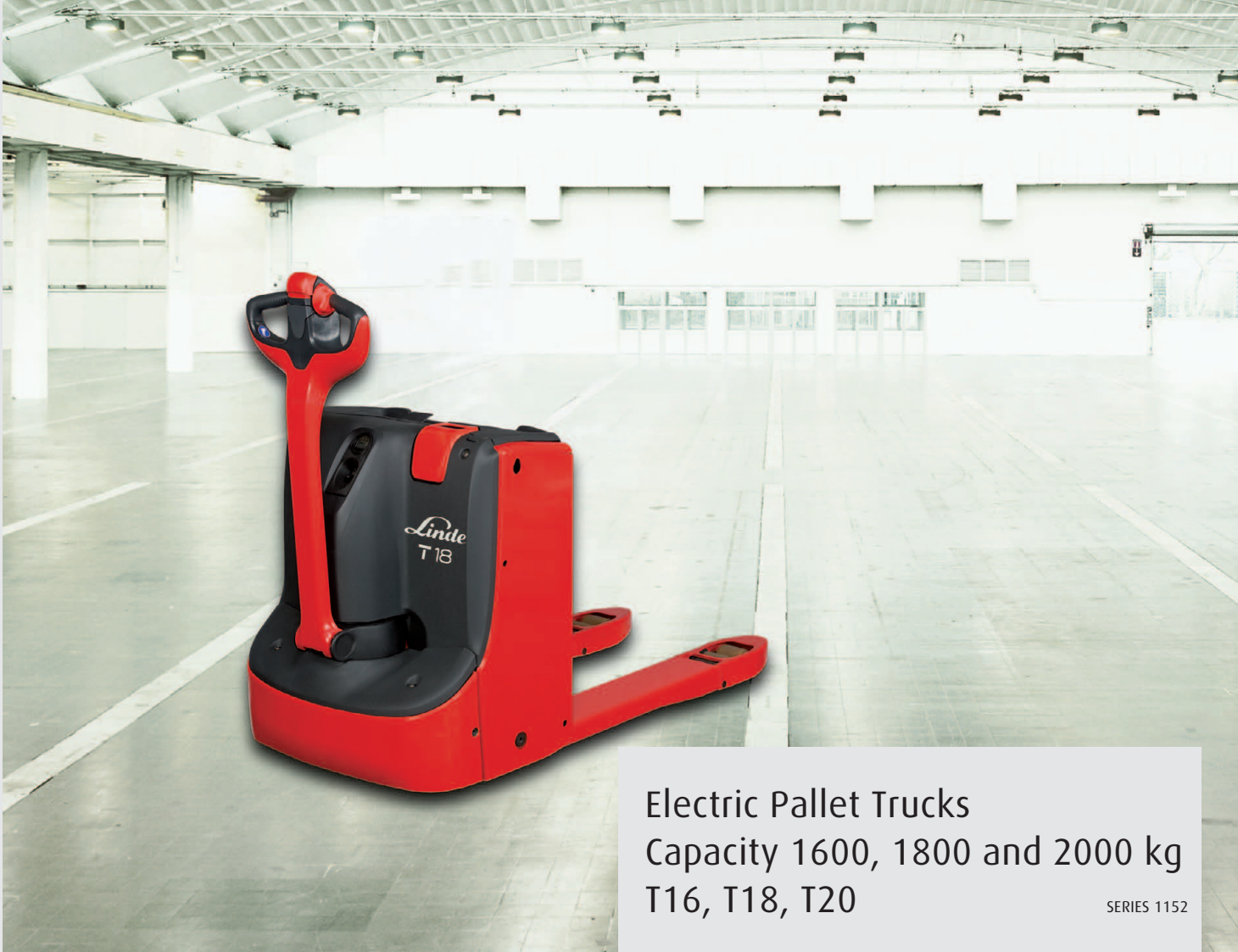
Electric Pallet Trucks Capacity 1600, 1800 and 2000 kg T16, T18, T20